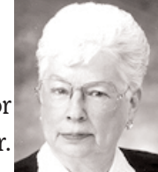
Elsie Wayne, MP