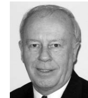
Loyola Hearn, MP