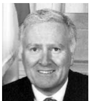
Bill Casey, MP